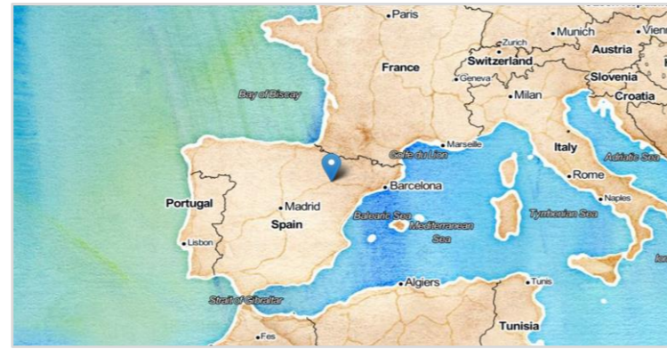
Map tiles by Stamen Design CC BY 3.0 Map Data © OpenStreetMap