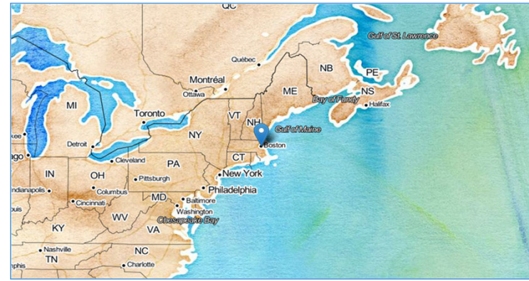
Map tiles by Stamen Design CC BY 3.0 Map Data © OpenStreetMap