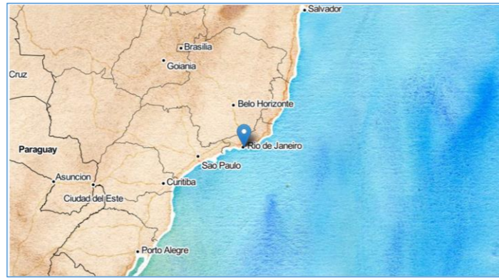
Map tiles by Stamen Design CC BY 3.0 Map Data © OpenStreetMap

(UN World Urbanisation Prospects 2022 estimate)