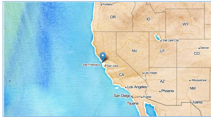
Map tiles by Stamen Design CC BY 3.0 Map Data © OpenStreetMap