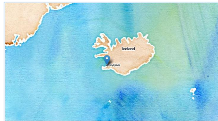
Map tiles by Stamen Design CC BY 3.0 Map Data © OpenStreetMap