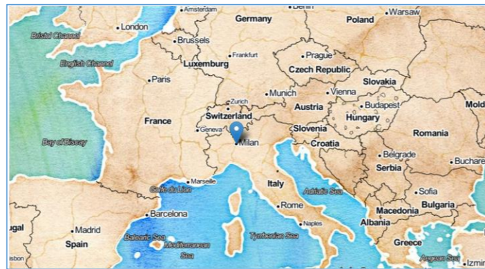
Map tiles by Stamen Design CC BY 3.0 Map Data © OpenStreetMap