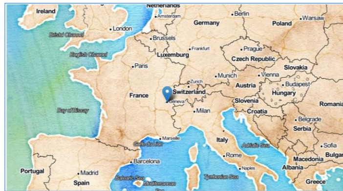
Map tiles by Stamen Design CC BY 3.0 Map Data © OpenStreetMap