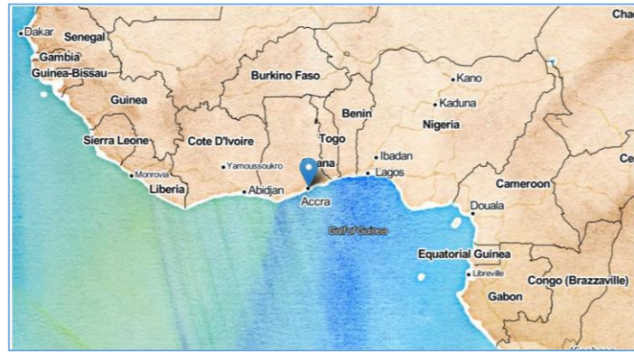
Map tiles by Stamen Design CC BY 3.0 Map Data © OpenStreetMap

(UN World Urbanisation Prospects 2022 estimate)