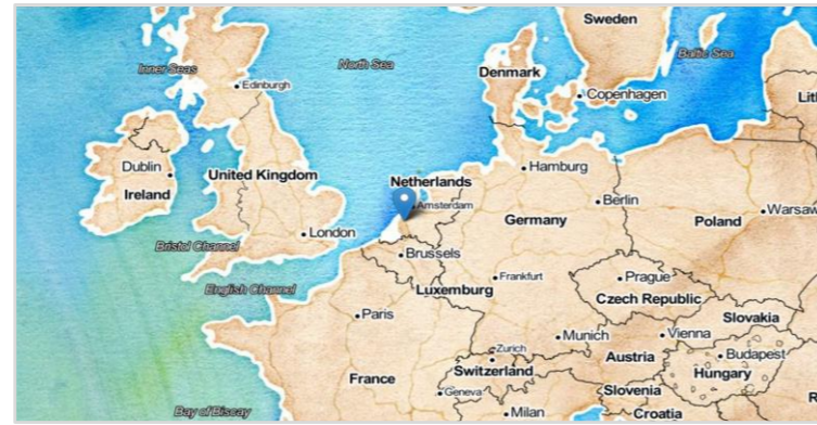
Map tiles by Stamen Design CC BY 3.0 Map Data © OpenStreetMap