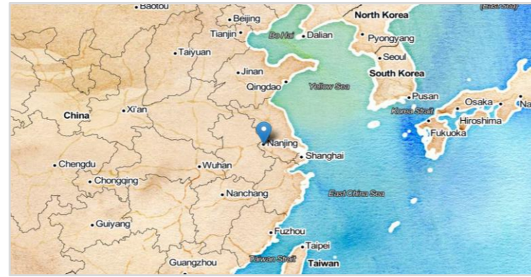
Map tiles by Stamen Design CC BY 3.0 Map Data © OpenStreetMap