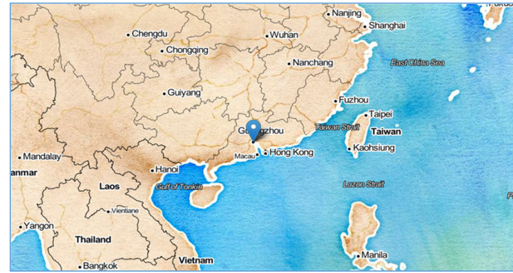
Map tiles by Stamen Design CC BY 3.0 Map Data © OpenStreetMap