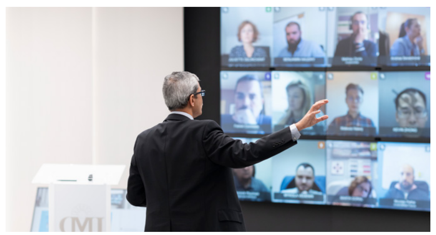
IMD is embracing technology to enhance learning impact.